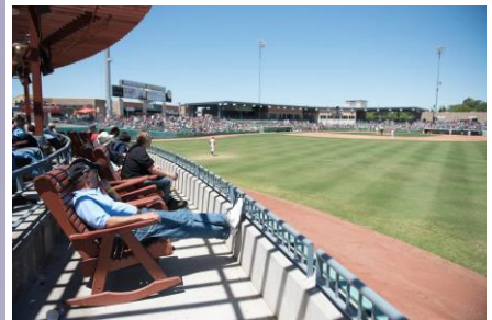
Comfortable Rockers in the outfield, bring your mitt.