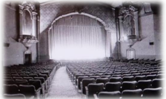
The Fox California Theater opens...