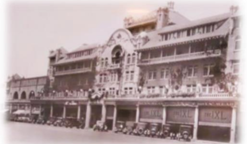
Transportation hub, the Hotel Stockton was the valleys' gem