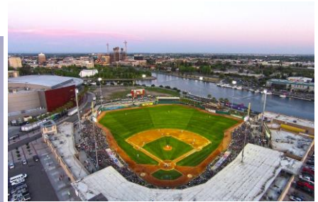
Stockton Ports Field