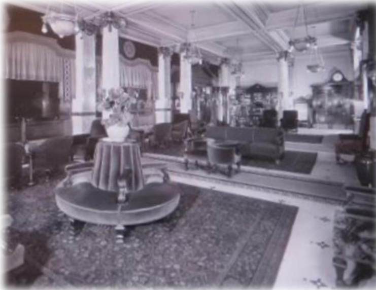
Lavish Lobby at the Clark Hotel, Sutter & Market Streets