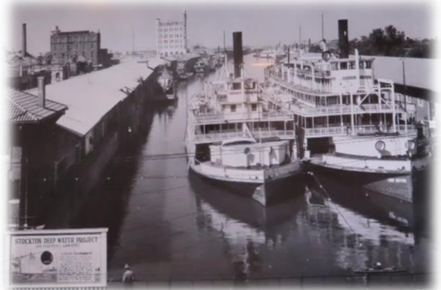
Stockton's Greatest Landmark: Water