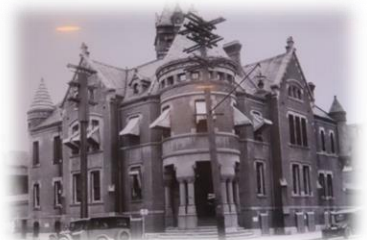
Cunningham's Castle At Channel and San Joaquin

Click here for our meeting LIVE NorthStocktonRotaryClub