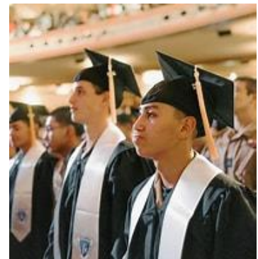
Discovery Challenge Academy Graduation