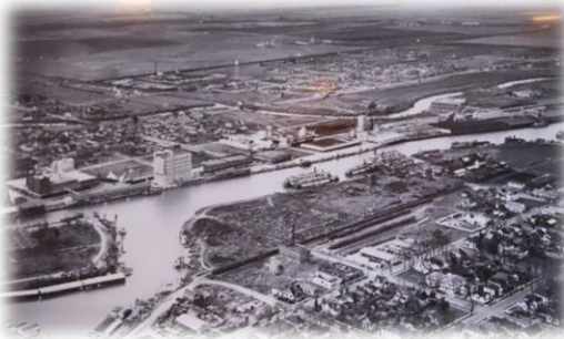
Stockton Channel & McLeod Lake