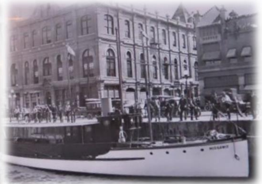
The Old Masonic Temple