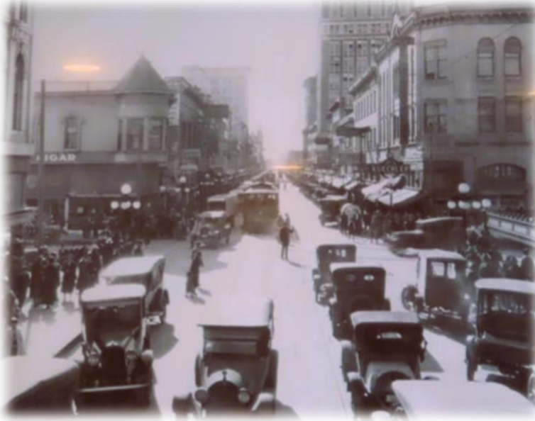
Downtown Stockton Main Street, 1926.